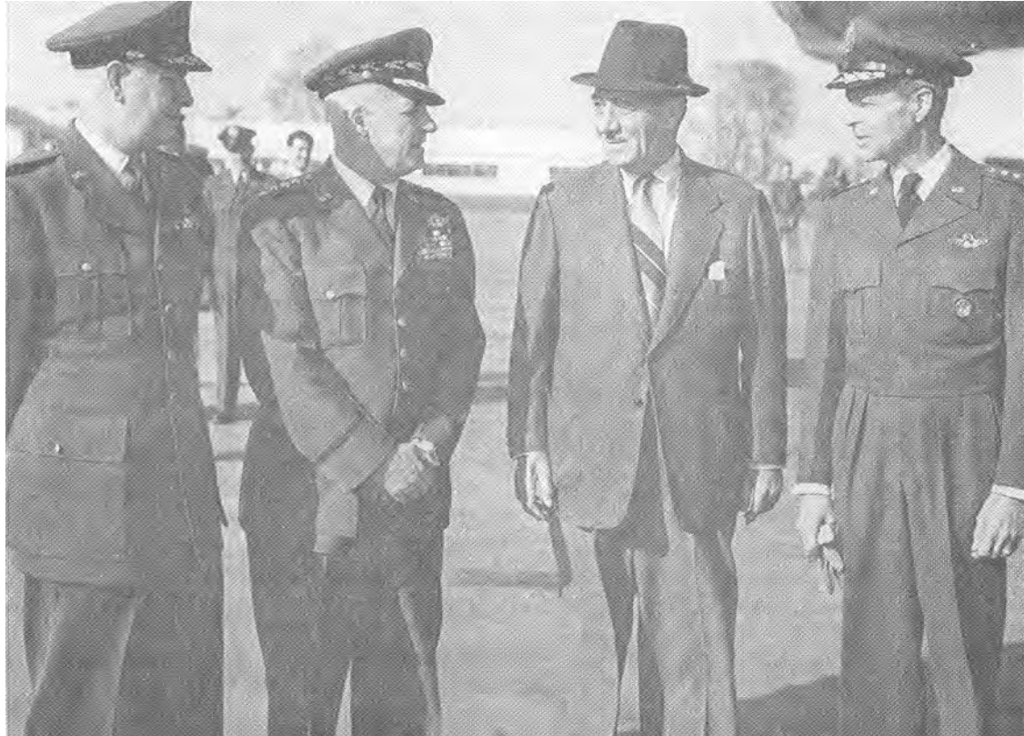
At Orly Field, Harold Talbot, then secretary of the Air Force, and General Nathan Twining, USAF Chief of Staff, are greeted by General Tunner, Commander-Chief, USAFE and Lauris Norstad, Deputy Supreme Commander for Air, SHAPE.

During the Berlin Airlift British Foreign Minister Ernest Bevin chats with General Lucius D. Clay, Military Governor of Germany, and General Tunner at Tempelhof Air Force Base.