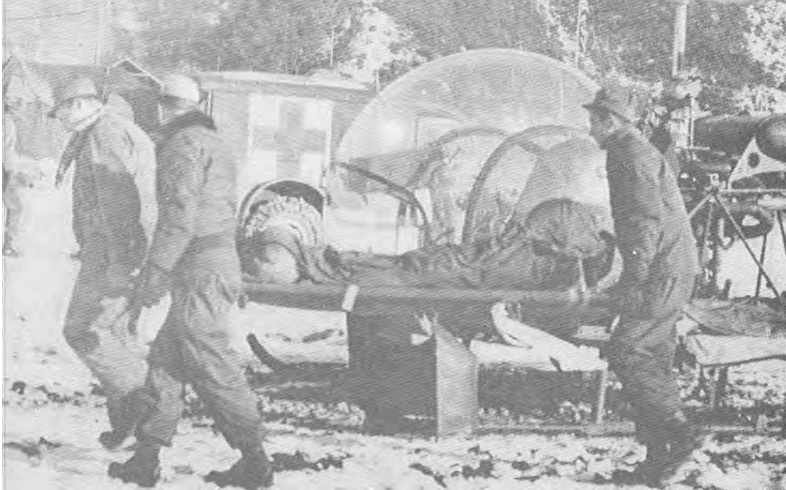
At this USAF hospital in Korea, a helicopter arrives from a forward Mobile Army Surgical Hospital with two wounded soldiers fastened in the litter-baskets on its side.