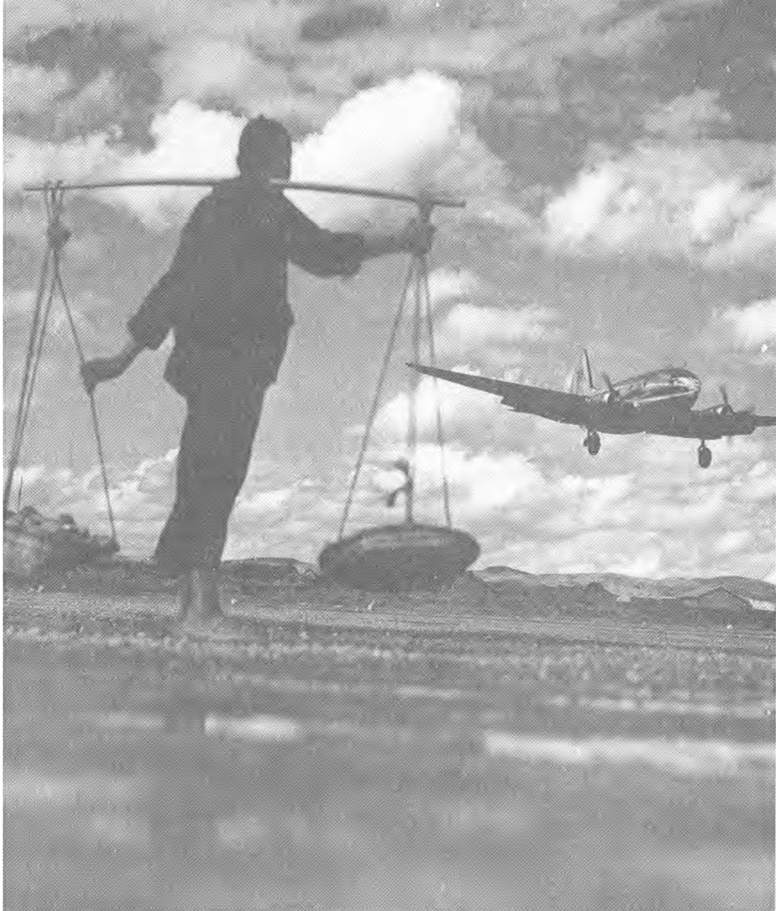
A lonely Chinese airfield shows the tremendous difference in cargo transporting techniques. The “very old” and the “very new” (at that time) were outlined clearly in the “Hump” campaign.