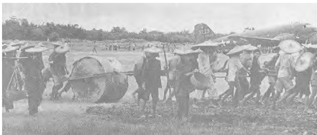
This is just a small insight into the amount of human labor that was necessary to build the airfield in the India-China Command. Earth was moved in the same fashion as it had been for thousands of years. Also, note rollers pulled by crew.