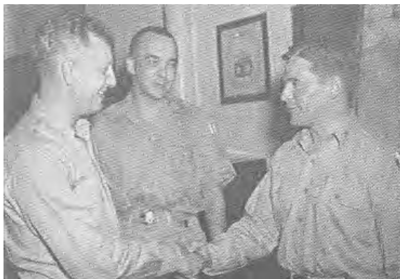
United States Air Force Photograph

General Tunner discusses plans with King ibn-Saud of Saudi Arabia for use of Dhahran Airfield by USAFE forces. Also shown, at left, is U.S. Ambassador Wadsworth.