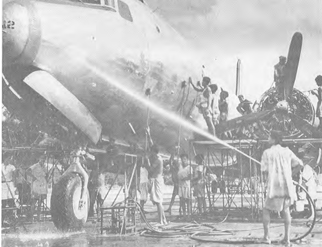
This veteran C-54 shows the effects of the much publicized—and severe —“Hump” weather. No amount of washing could remove the dimples caused by heavy hail on the skin of the aircraft. Serial numbers were often peeled off.