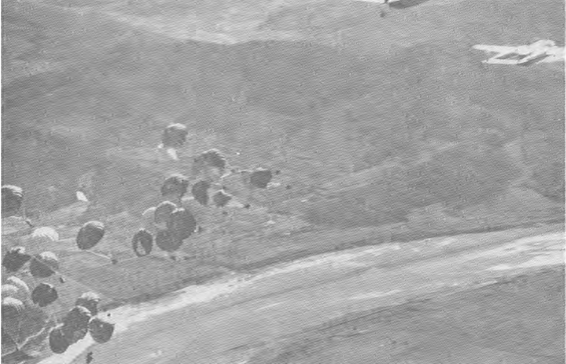
Multicolored parachutes blossom into the skies of northwest Korea, near Unsan, as the U.S. Far East Air Force Combat Cargo Command completes a drop of 80,000 pounds of ammunition and supplies to the ROK First Division.